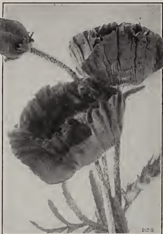
PAPAVER ORIENTAL POPPY